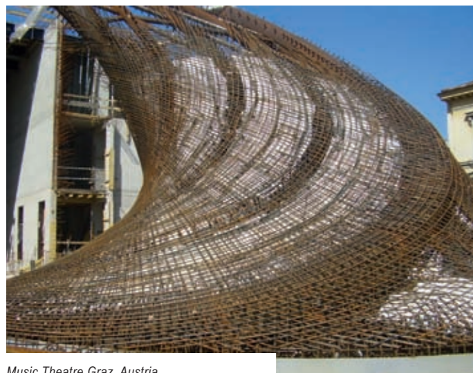
Music Theatre Graz, Austria Engineering Office convex ZT GmbH, Graz